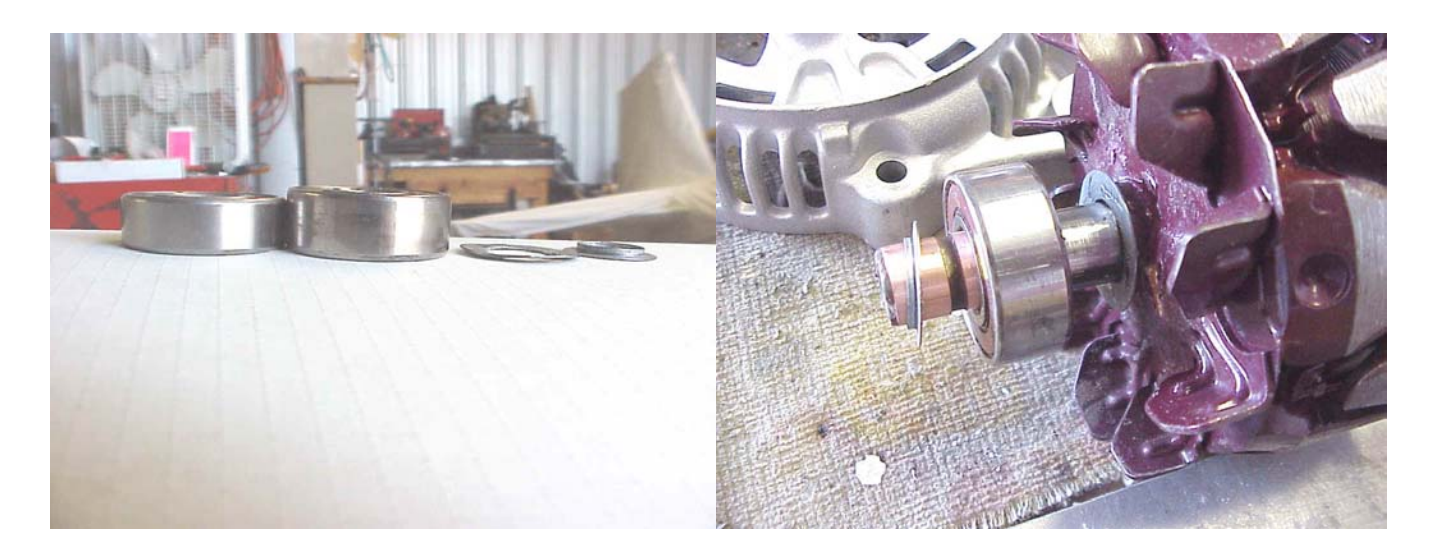
Continue with Reassembly