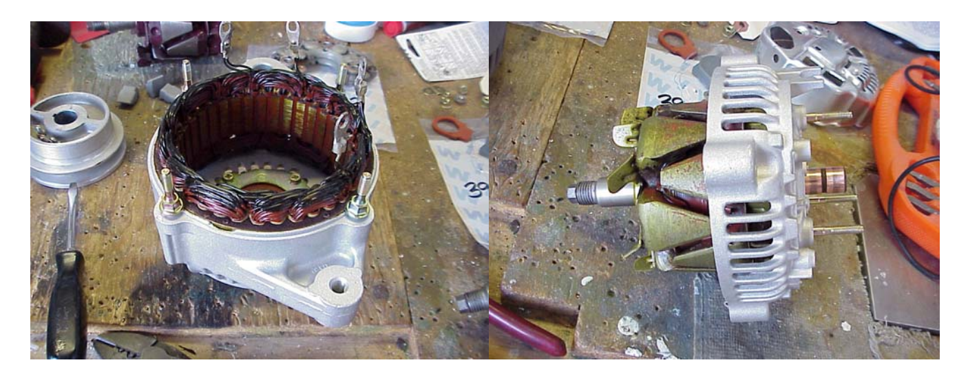
The old rotor may be gently tapped out of the rear case by supporting it at the split line and using a small center punch on the rotor shaft.

These next images show the backside of Honda rotor (left) next to the Toyota rotor (right). As you can see the Honda rotor has correctly for centrifugally moving the air from the front and rear inlets to the side outlets. Other than the fans they are identical.