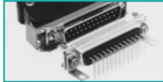
MD25M20JVLZ (left) and MD25F5R30V3X (right) shown above.